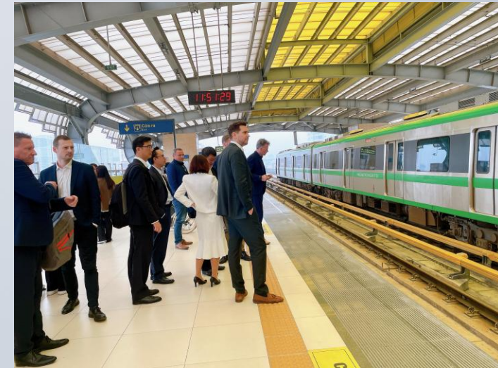
Delegation experience at Hanoi Metro