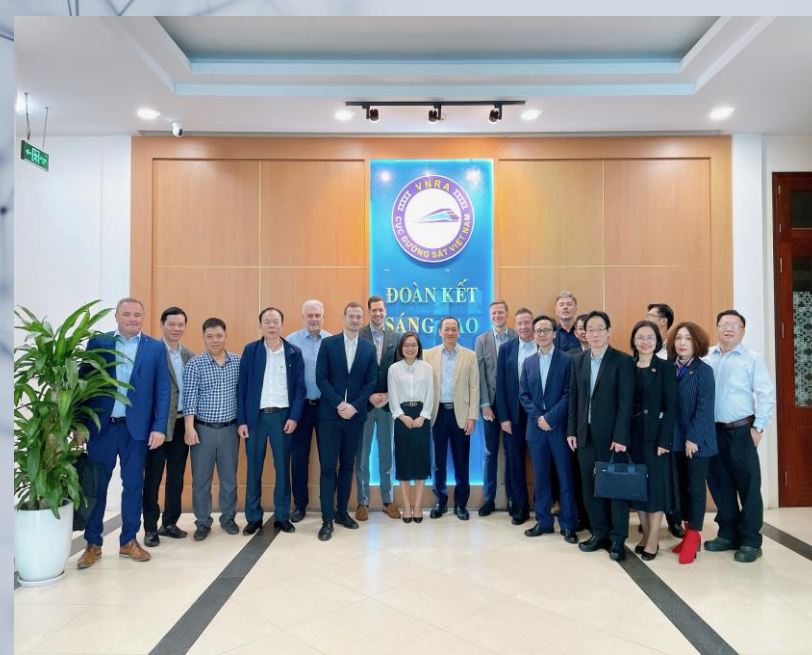
Delegation visit to VNR